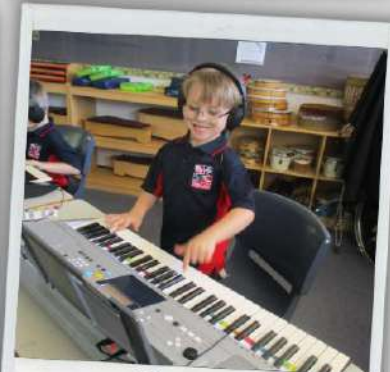
Fun with electric keyboards