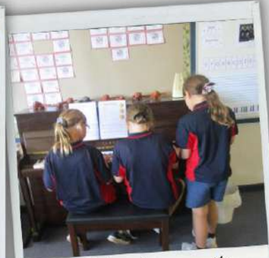
Collaborating on the acoustic piano