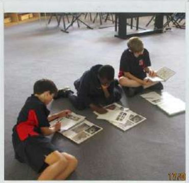
Researching the "Elements of Design" for Photography