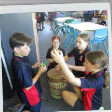
Foley Art for sounds effects in movies