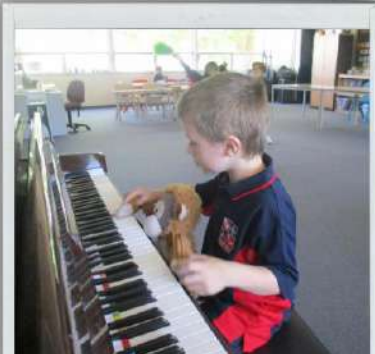
Helping Monkey to play the piano