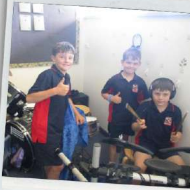
Electric drum kit